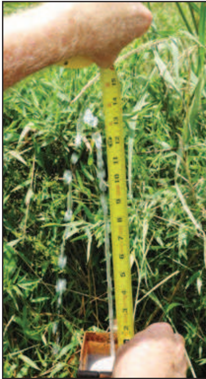
Measuring the increase in the hydraulic pressure of the water table from the elevation monitoring well.