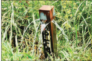
Life giving water spews from the water table elevation monitoring well. The well is on the proposed Pintail Landfill site.

Pintail admits that their land-fill application does not meet TCEQ regulations