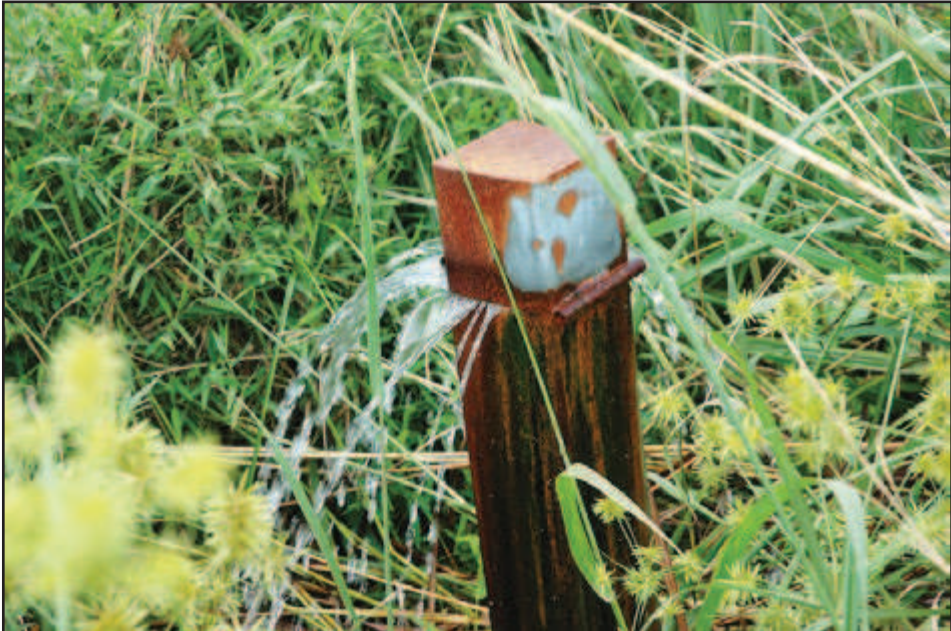
Above, Water table elevation monitoring well spewing groundwater. Below, the stream begins to rise from the water pressure.

If anyone has questions about the status of this process, Mayor